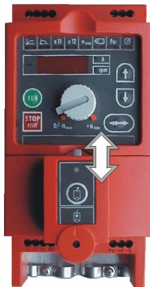
Fig. 4: Mounted parameter module

You can then slide the parameter module from the top onto the cover of the MOVITRAC® 07 unit. Simply reverse the process to remove the parameter module.