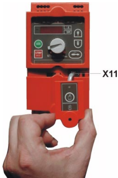
Fig. 2: Connection to MOVITRAC® 07

The parameter module is equipped with a short piece of cable and a Western plug. This plug is connected to X11 (RS-485) for MOVITRAC® 07.