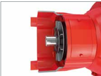
Motoradapter with radial fan; Available up to size IEC 355