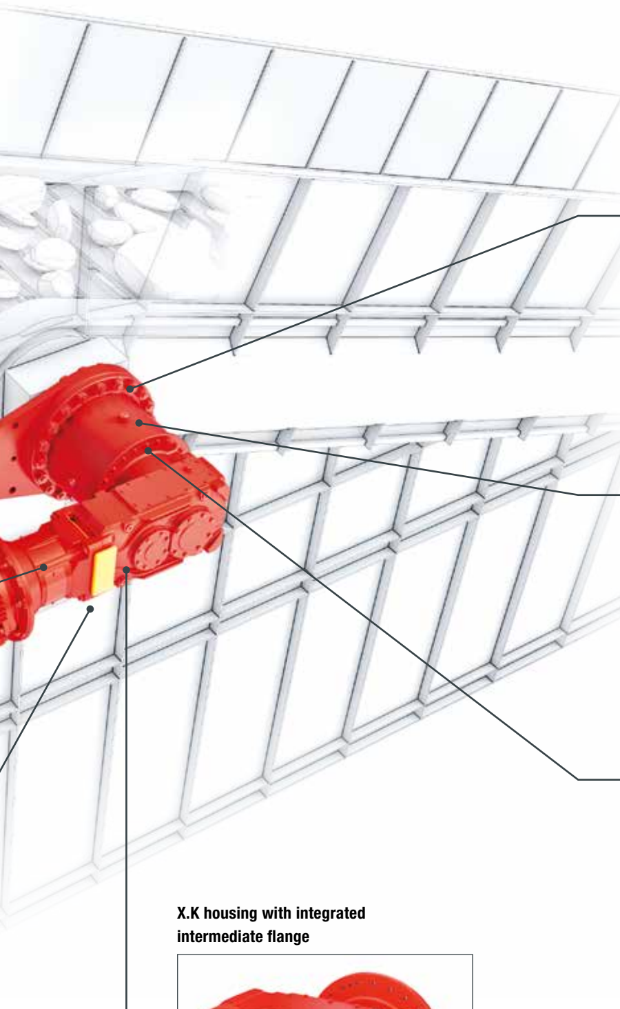
Solid shaft with key